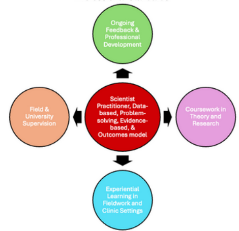
Professional Training Model Based on Accreditation & Professional Standards