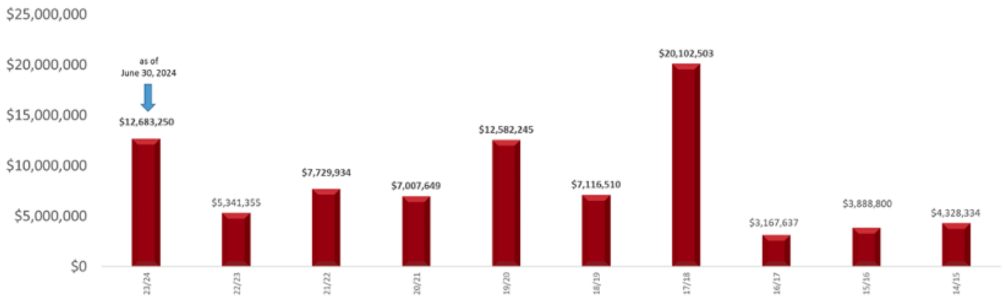
Historical Comparison for Total Raised (FY2014 - FY2024)

Over the past 10 years, University Advancement has raised an average of almost $7 million per year, a $3 million increase from the previous decade's average. With an ambitious goal to increase this by another $3 million annually over the next five to seven years, the university is poised for continued growth.